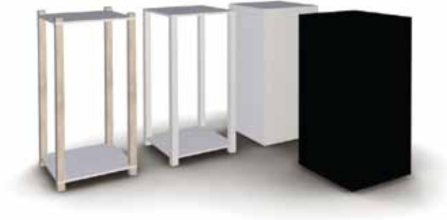
P50/100 A P50/100 B P50/100 C P50/100 D