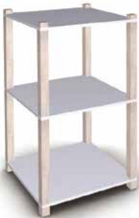
S 50/50 shelf