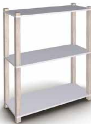
S 33/60 shelf