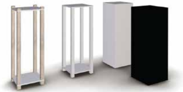
P35/100 A P35/100 B P35/100 C P35/100 D