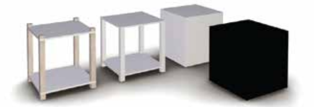
P50/50 A P50/50 B P50/50 C P50/50 D