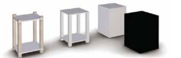
P35/50 A P35/50 B P35/50 C P35/50 D