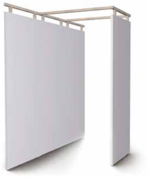
WB/W panel spacer 500mm - 3000mm